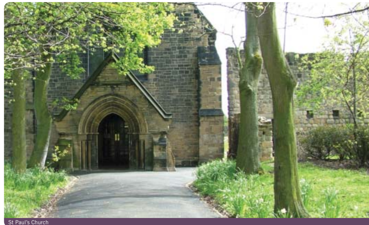
St Paul's Church