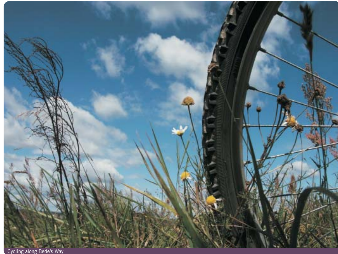
Cycling along Bede's Way

To explore our countryside, coast and culture visit the Great North Forest.